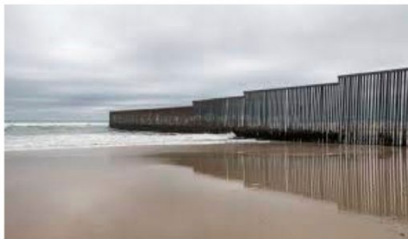
A section of the barrier, made out of steel slats, ending in the Pacific Ocean in San Diego—Tijuana

Three films are included: a recent documentary, The River and the Wall , the adaption of Cormac McCarthy's All the Pretty Horses , and a classic film about immigration, El Norte .